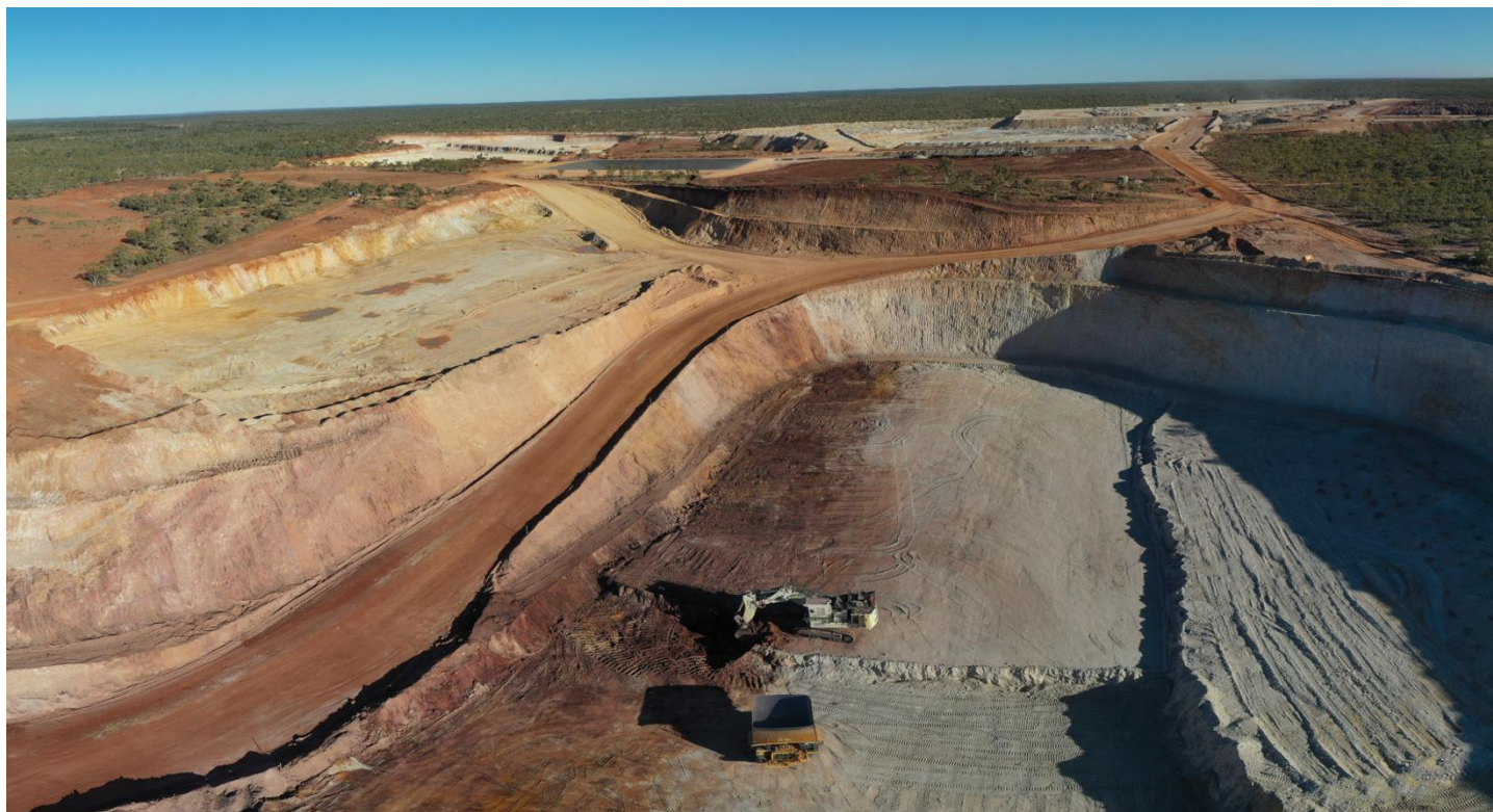
Figure 4. Anthill east pit with ore being mined (front, Centre).