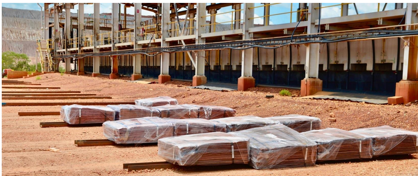
Figure 2. Copper bundles ready for back-loading to Townsville Port.

In summary, Austral has delivered on its objectives to bring its new Anthill mine into production, thanks to the exemplary efforts of its team and contractors onsite. Overburden mining exceeded projections with ore production also comfortably exceeding plan, resulting in mine production being de-risked.