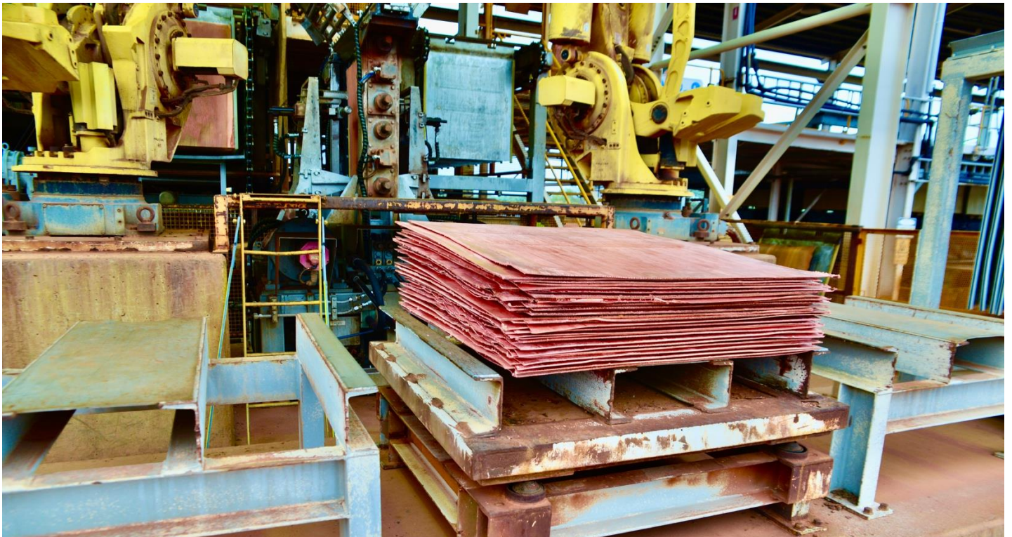
Figure 7. Stripping and stacking copper cathode sheets at the electro-winning circuit.