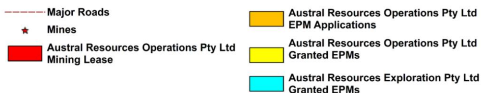
Figure 9. Austral tenure map showing 2,140km 2 of tenements (EPMs and EPMA).