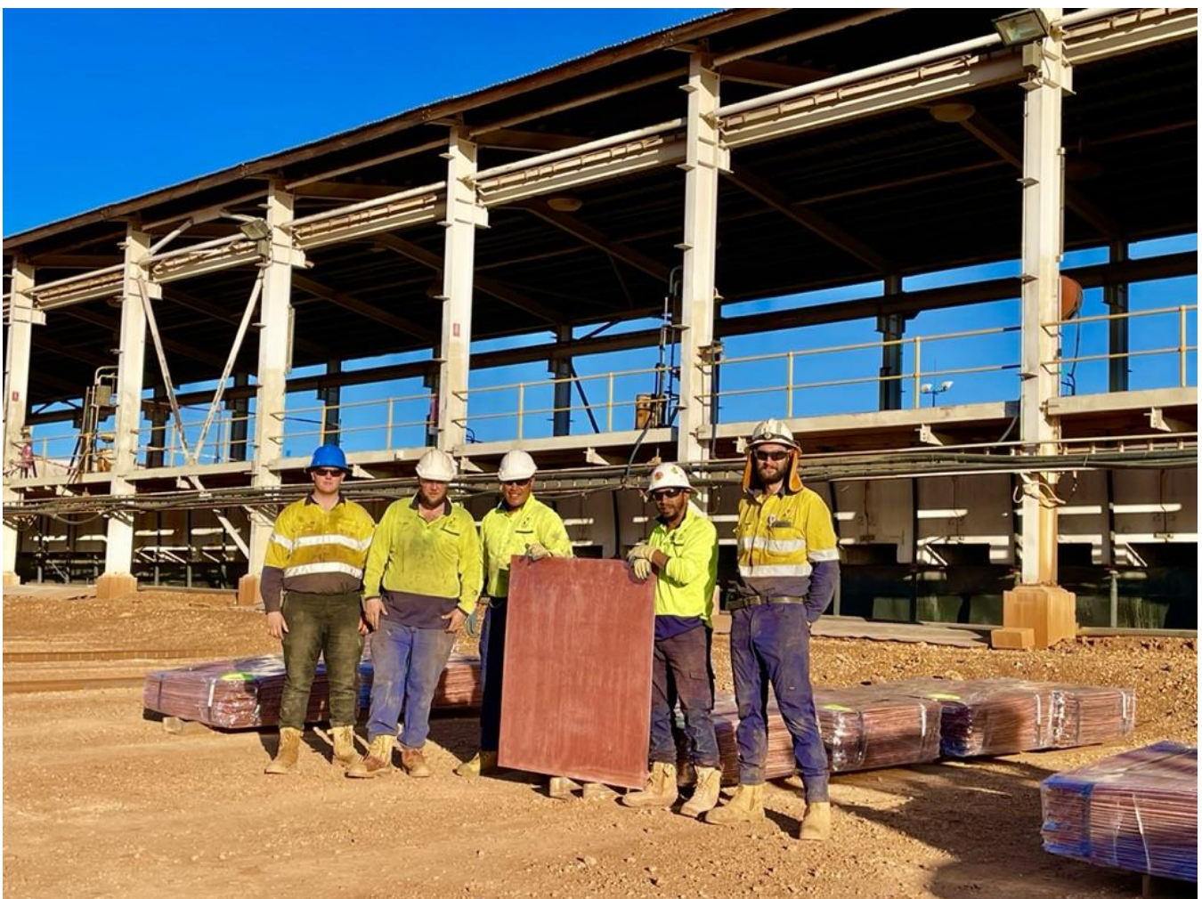
Figure 5. First copper cathode sheet produced from Anthill ore in mid-June. Electrowinning tank house in background.

Although not industry specific, the Company has also experienced supply chain issues resulting from the ongoing pandemic, which has also impacted upon production rates.