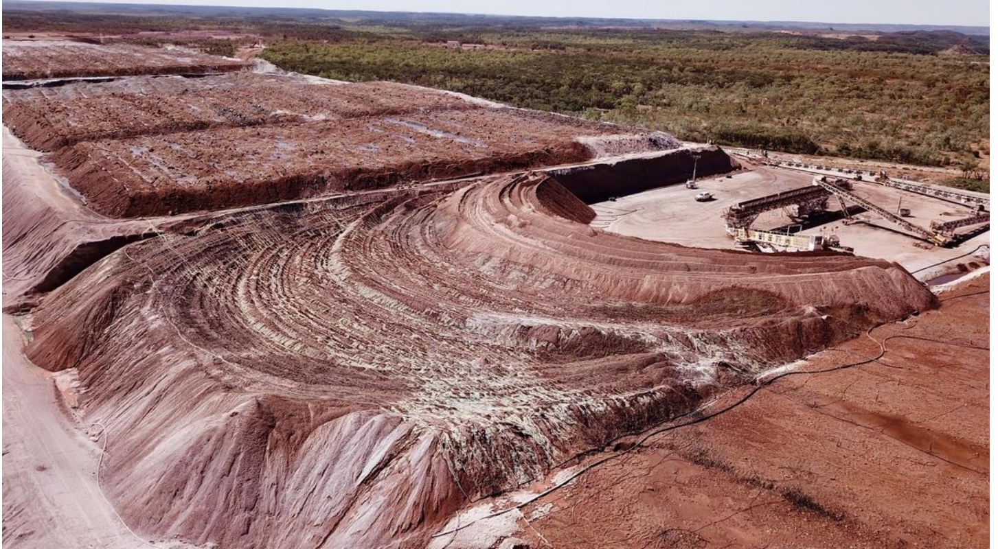
Figure 6. Pad 8 being stacked in June.