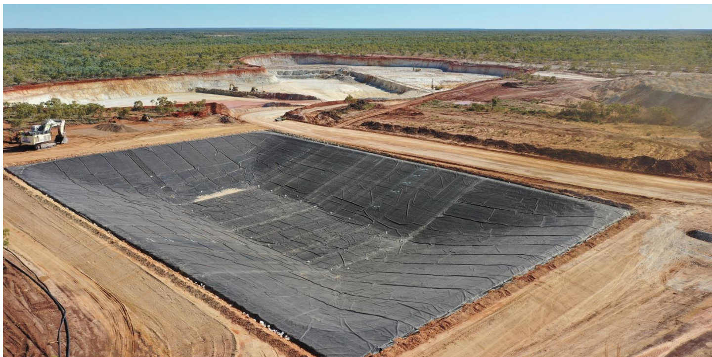
Figure 3. Anthill west pit in background with 55ML water dam in foreground.

Ore stockpiles at the end of July were 309,000t containing 2,350t of recoverable copper.