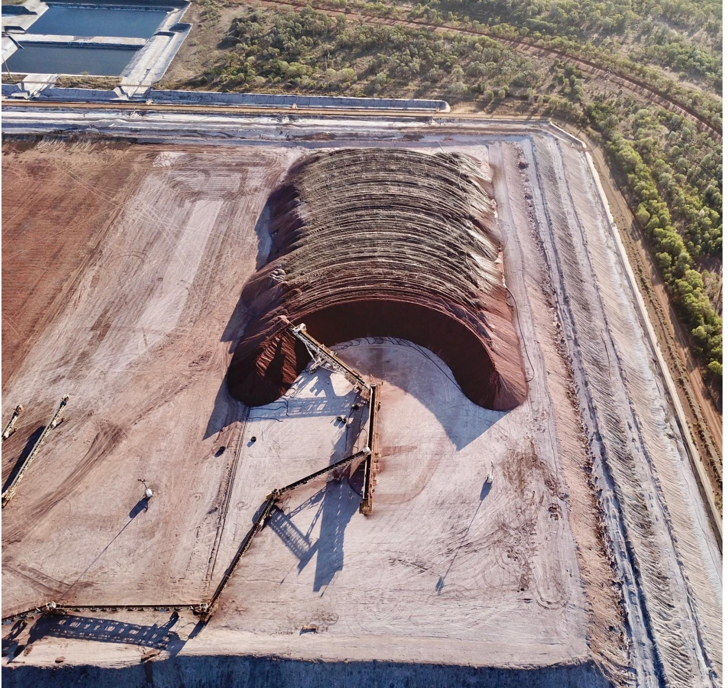
Figure 1. Ore stacking at Pad 21, Mt Kelly heap leach pad. Process ponds in background. Adjacent Pads 19 and 20 to left hand side are ready to accept ore.